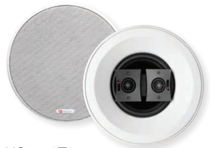
HSi 470T2 6½" Stereo In-Ceiling Speaker